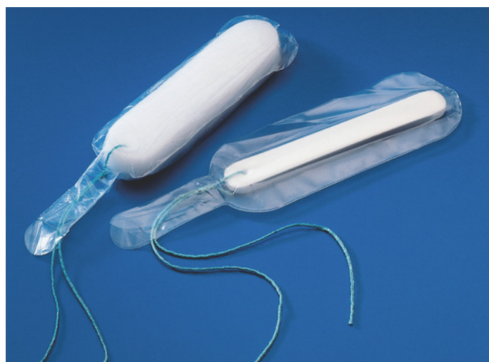
NETCELL Series 5000 (NET)