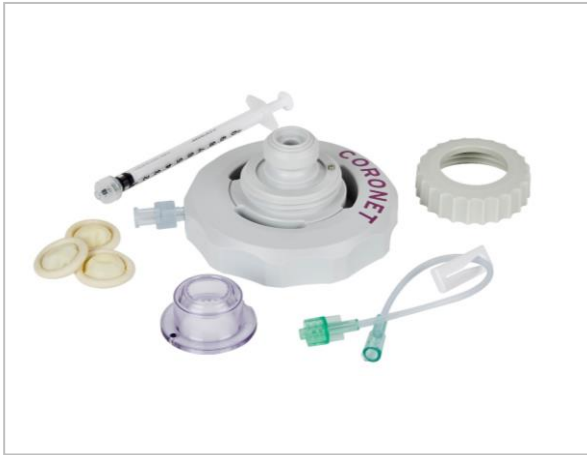
51-3000 Surgical Trainer