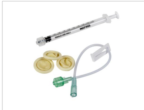
51-3010 Surgical Trainer Refill Kit